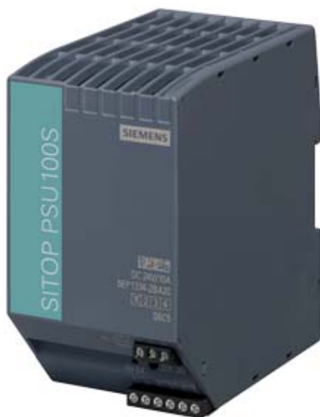
SITOP PSU100S 24 V/10 A STABILIZED POWER SUPPLY INPUT: 120/230 V AC OUTPUT: 24 V/10 A DC